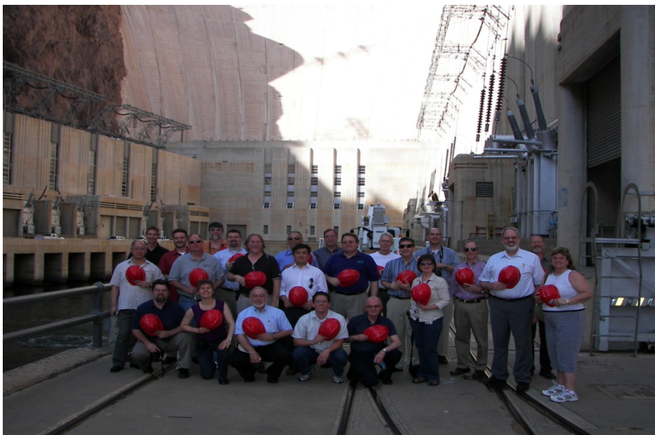
The SDT Order 706 turns a corner in Boulder City

The SDT adjourned at 3:45 p.m. on May 14.